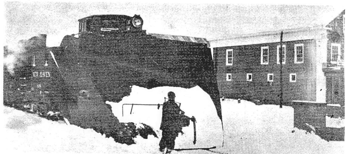
Old Colony train with snowplow approaches Kingston depot.

And so we did, bag in hand, down the long concrete platform as fast as we could go. I knew that the train went slowly out of the station and through the marshalling yards so there was at least an even chance that we'd make it. In a few moments the conductor and trainmen came onto the rear train platform and shouted encouragement. We were gaining and soon we threw our suitcases into the hands of the platform cheerers, and really ran. By the time we had covered another